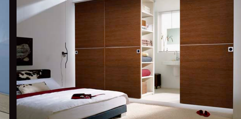
AIR Solid Door Hardware