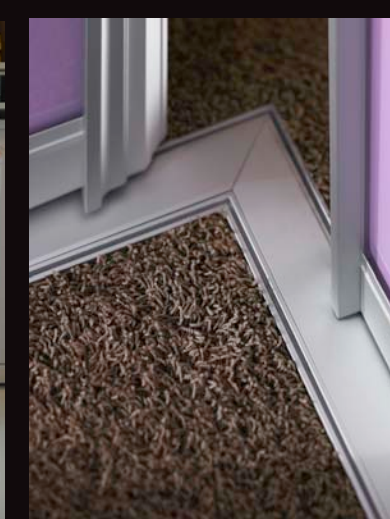
S300 Bi-Fold Door