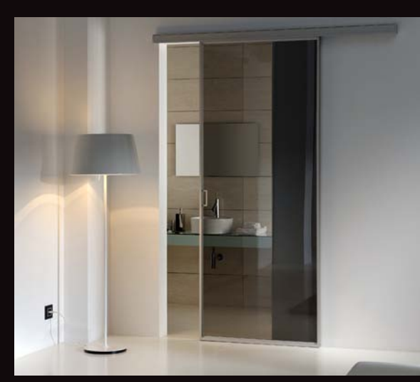
S1500 Square AIR Sliding Door

AIR System_ Perfect solution when a floor track is not an option — ideal for healthcare. Available as wall- or ceiling mounted. 3 aluminum frame stiles, 26 panel options, keyed locks, ADA handles and unlimited powder coat choices.