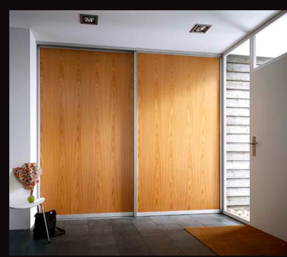
S300 Sliding Door

S34 Bottom Rolling System _ Well suited for residential or multi-family projects. Use as closet doors or room dividers. 4 aluminum frame stiles, and 26 standard panel options. Option to integrate tracks seamlessly into the floor surface.