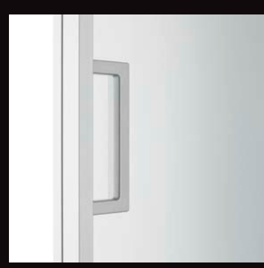
SWING Door Slim