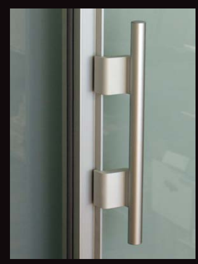
AIR ADA Handle Detail

• Available as Made-to-Measure assembled doors, Made-to-Measure frame-kits, Bulk or Fabrication