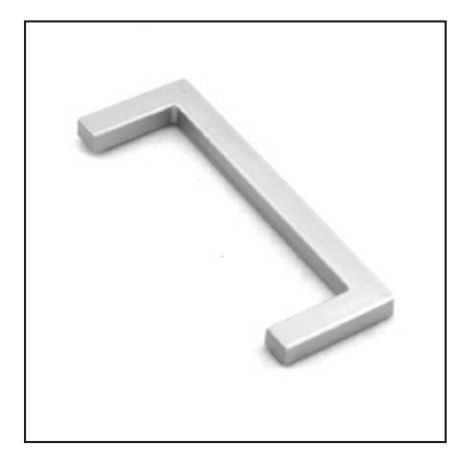
2_ Half rectangle applied handle