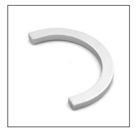
1_ Half circle applied handle